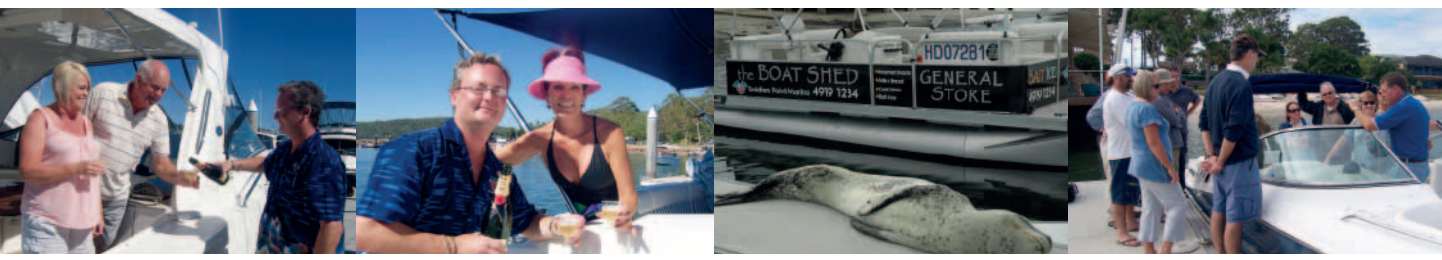
New Years Day complimentary French Champers for all marina customers.