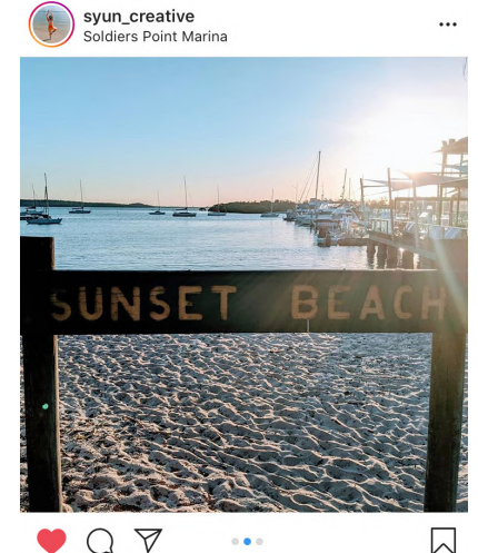
Liked by dawid_regulski and others syun_creative Sunset Beach is a nice place to walk on the beach, when we can go outside again... more