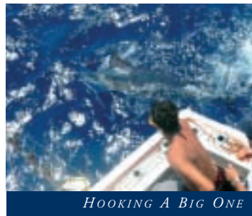
HOOKING A BIG ONE

number of spectators with the excitement and action of big blue-water game fish. With the completion of the new berth extensions at Soldiers Point Marina now's the time to book your berth for the tourna-