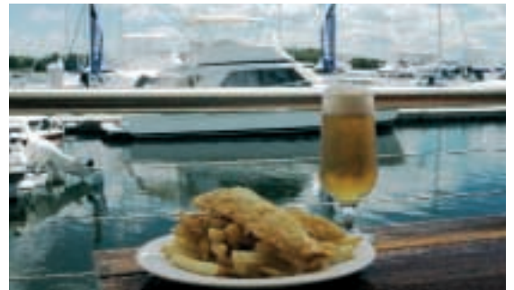
SOME OF BIMINI BAR'S FINE FARE

New Years Eve bookings are being taken now so call on (02) 4984 7111 .