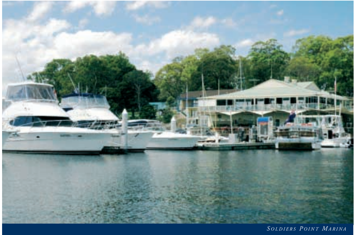
SOLDIERS POINT MARINA