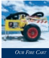
OUR FIRE CART

TO COMPLEMENT the standard fire-fighting equipment and to help protect your investment we have invested in a new 'instant response fire cart'. Designed specifically for marinas, this fire extinguisher can be quickly moved by one person, and uses seawater as opposed to piped-in water, turning it into foam to retard the fire. Tried and tested by the Queensland Fire and Rescue Authority, we are happy to have it here at Soldiers Point Marina. We understand that it is strong enough to extinguish a fire outright, or at least keep it under control until the professional fire fighters arrive.